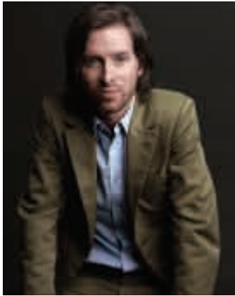
Images of Rome From left: Director Wes Anderson, a scene from Francis Ford Coppola's Youth Without Youth, premiering at the Rome Film Fest; the Spanish Steps.